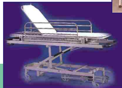
Emergency & Recovery Trolley